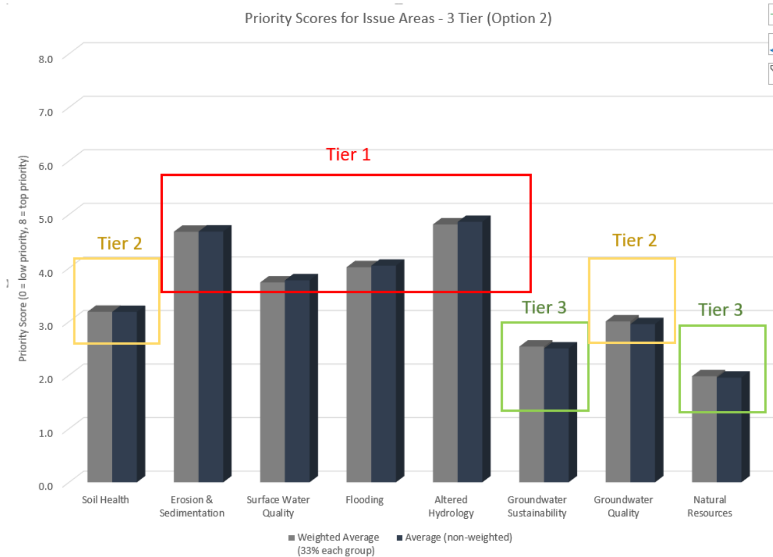
Figure 3 Proposed Issue Hierarchy Option 2 (Three Tier)