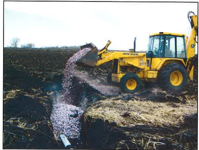
Rock intake installation in the Rush River Watershed.

Watershed staff would like to extend a big thank you to everyone who has participated in our TMDL Project for low dissolved oxygen within the High Island Creek and Rush River watersheds. This success would never be made possible without the continuous interest and willingness to implement practices from each and every landowner who participated. The water quality improvements that will occur due to the practices that were incentivized or cost shared with during this project will not go unrecognized!