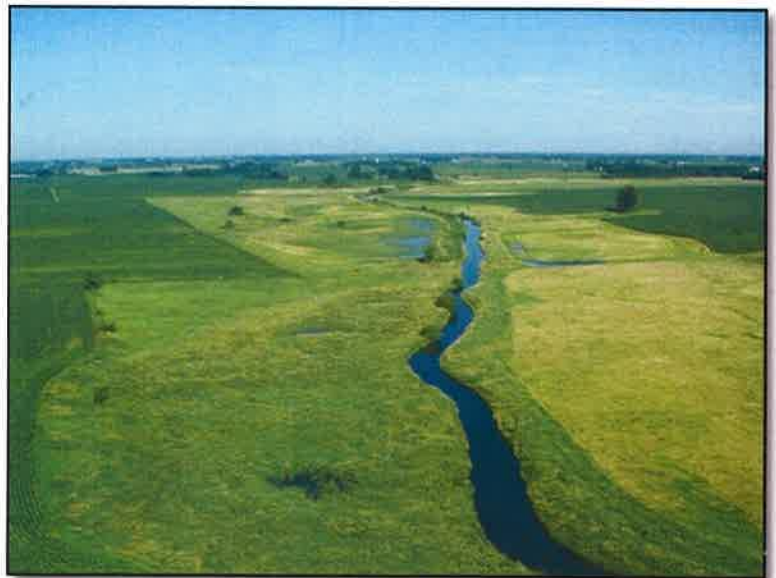
Buffer along the mainstem of High Island Creek West