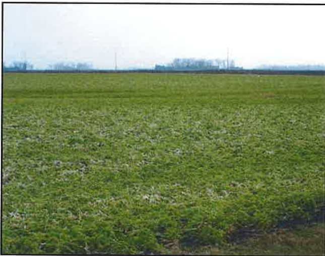
Cover crop implemented in the High Island Creek Watershed.

In February of 2016 the High Island Creek and Rush River watersheds were awarded federal 319 grant funding to help improve nonpoint source pollution issues on the landscape. Funds were available to incentivize buffer strips and cover crops along with cost share options for open intake alternatives. During the first few months the project took some time to gain momentum, but as residents became more aware of the available funds and the positive things that can happen to their property due to these best management practices, the project took off and has been utilizing these funds ever since. Currently, after 1.75 years of active status to the project, we have encumbered all funds that were available, combined totaling more than $100,000 dollars! That is a lot of money going directly toward conservation and water quality improvements on a local scale!